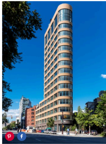
The soaring glass tower has a unique triangular profile ↗

Designed by architect Cary Tamarkin, this recently completed Manhattan duplex penthouse boasts 360-degree views of the Empire State Building, One World Trade Center , and Hudson River Park. Located between Broome and Spring streets on Sullivan, the sprawling penthouse offers over 5,000 square feet of living space on the top two floors of the tallest residential building in the area. The home's defining features are soaring multipaned casement windows that rise 23 feet and curve on the southernmost side. There's a massive great room with staggering views in every direction, a chef's kitchen with marble counters , a den, a parlor, and a 404-square-foot wraparound corner terrace. The upper floor houses the master suite and additional bedrooms. The real jewel of the space is its 978-square-foot rooftop terrace, where the city views are unparalleled. Listed for $28.5 million, this 5,505-square-foot home has 5 bedrooms, 5 baths, and 2 half baths. Contact: Douglas Elliman, 212.891.7104; 10sullivan.com