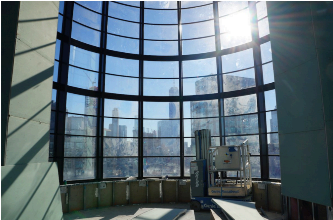
The penthouse at 10 Sullivan Street

The development promises to be one of the tallest in Soho, where zoning and landmarking have prevented most construction beyond 10 or 12 stories. YIMBY toured the site earlier this week, and we were struck by the views from the roof, which stands 203 feet tall. But a few taller buildings have sprouted to the west in Hudson Square, including the 498-foot-tall Trump Soho. Zoning there was relatively generous until the city rezoned the neighborhood in 2013, capping new building heights at 290 feet .