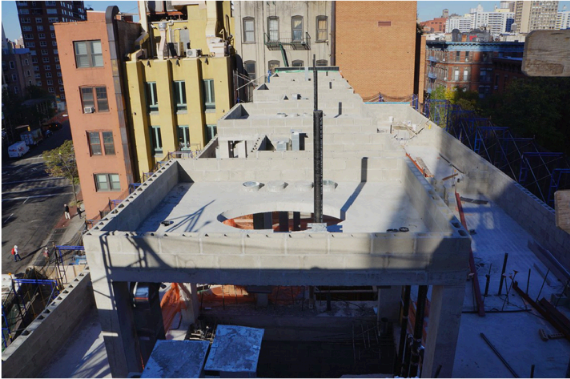
Looking down at the unfinished Sullivan townhouses from the 5th floor terrace

Property Markets Group and Madison Equities are developing the project, which will get its first residents in January.