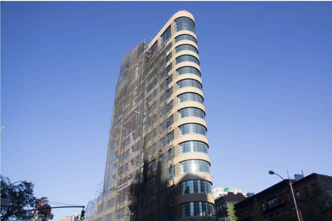
10 Sullivan Street