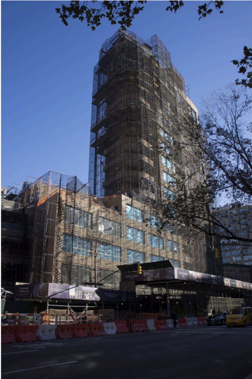
10 Sullivan Street from 6th Avenue

The ground floor will host 1,800 square of retail and a 10-car parking garage, where condo owners will be able to purchase spaces.