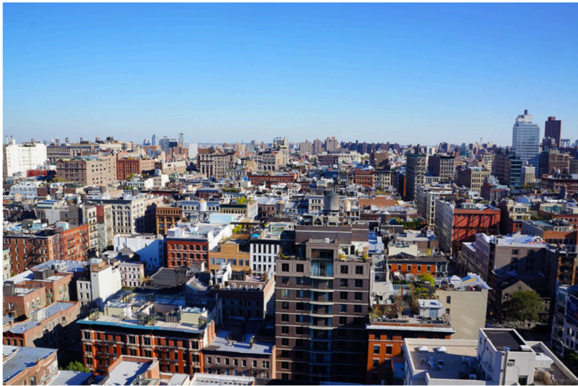
Looking east from the roof of 10 Sullivan

The development promises to be one of the tallest in Soho, where zoning and landmarking have prevented most construction beyond 10 or 12 stories. YIMBY toured the site earlier this week, and we were struck by the views from the roof, which stands 203 feet tall. But a few taller buildings have sprouted to the west in Hudson Square, including the 498-foot-tall Trump Soho. Zoning there was relatively generous until the city rezoned the neighborhood in 2013, capping new building heights at 290 feet .